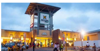
Accra Mall – Offers stores like Mango, Nike, Shoprite, and more (10km from city center)