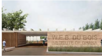
W.E.B. Du Bois Center is a Pan-African research center and final resting place of the activist. (7km from city center)