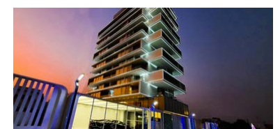
Osu Oxford Street – Vibrant street with cafes, shops, nightlife (3km from city center)