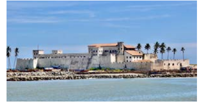
Cape Coast & Elmina Castles , located 3 hours away from Accra, has UNESCO World Heritage slave trade forts. (145km from city center)