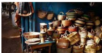
Arts Centre for National Culture – Souvenirs, Kente, beads, and wood carvings (5km from city center)