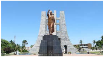
Kwame-Nkrumah Mausoleum , Memorial park dedicated to Ghana's first president (4km from city center)