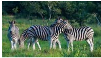
Shai Hills Reserve – Hike through scenic savannah and view baboons, antelopes, and caves (35km from city center)