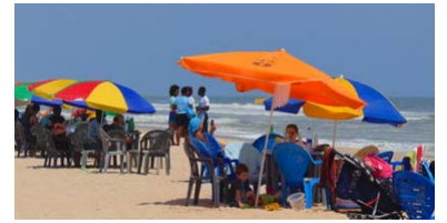
Bojo Beach – Clean, calm, and ideal for weekend relaxation (20km from city center)