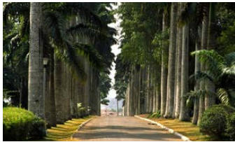
Aburi Botanical Gardens – Peaceful getaway with beautiful flora, just an hour's drive (25km from city center)